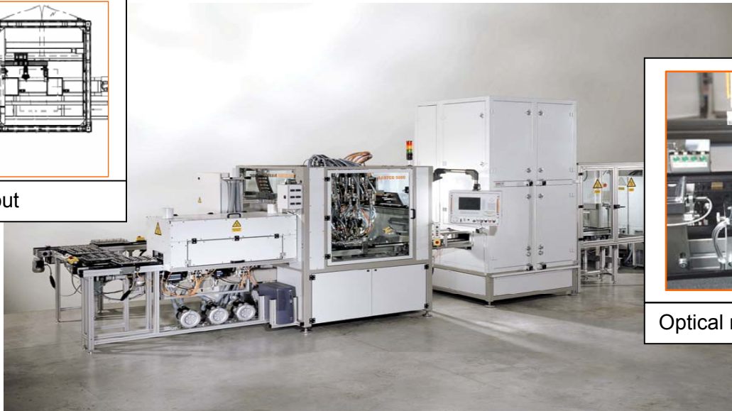
The BARTEC 560C cell in the automated production line